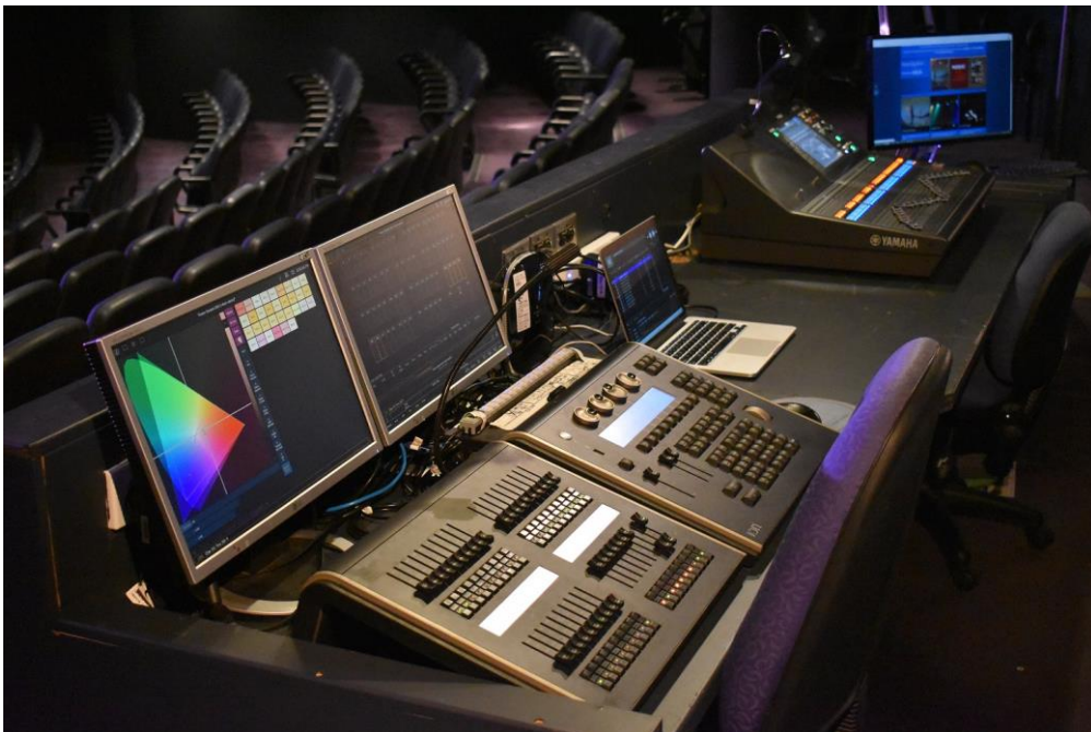
Control Room Sound & Lighting booth

Back, centre of Stalls. Dedicated position does not need seats moved