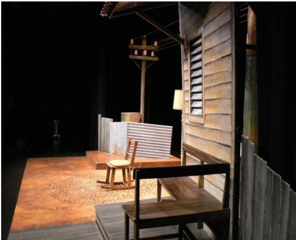
(My Grandma lived in Gooligulch) 2011 BMEC Season