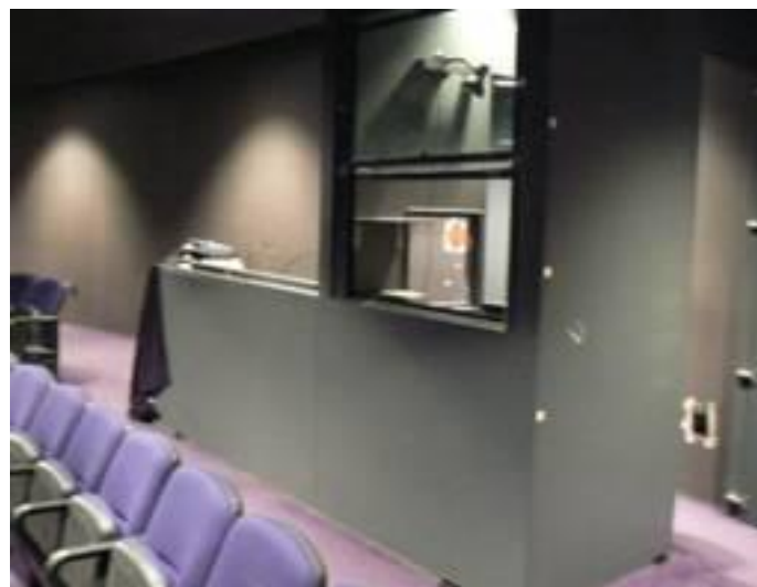
Control Room Sound & Lighting booth

Back, centre of Stalls. Dedicated position does not need seats moved